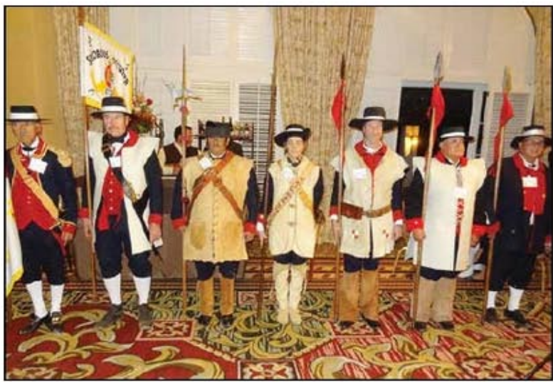
Reenactment soldados in full regalia for the heir to the Spanish throne Prince Felipe's visit to Santa Barbara