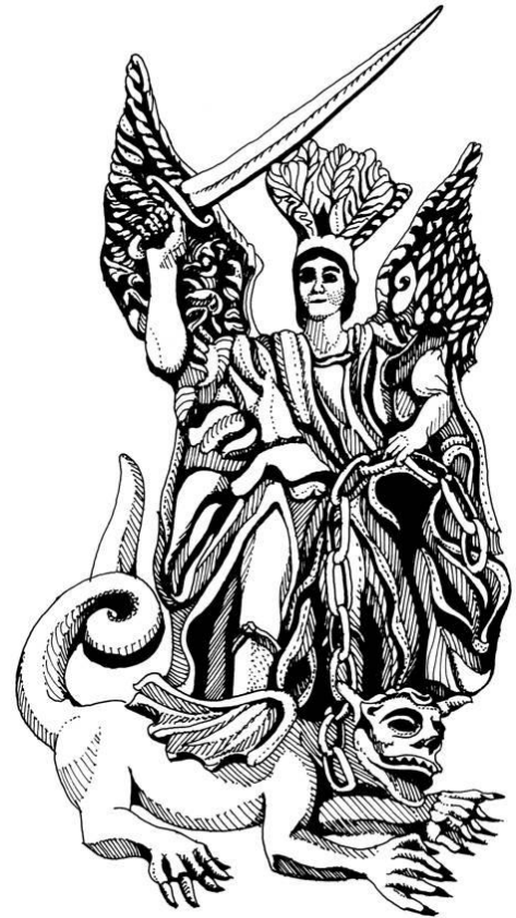
The Archangel Michael at Mission San Miguel Conzá. Drawing by Richard Perry.

The five mission churches that Fathers Serra, Crespi and Palóu created along with some 20 other Franciscans in active collaboration with their indigenous converts are a spectacular and fascinating architectural legacy. Unlike any mission churches in Upper California, their façades are “exterior altarpieces,” literal “sermons in stone” made of richly painted and intricately carved stone and stucco. Like the missions of Upper California, the Sierra Gorda complexes were allowed to fall into ruin and have been painstakingly restored through a series of 20th century efforts. The international importance of the Sierra Gorda missions was recognized in 2003 when they were collectively designated a World Heritage Site (Patrimonio de la Humanidad) by UNESCO.